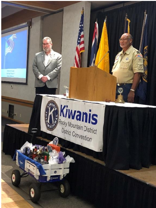
Gov Bob at opening ceremonies during the presentation of the flag in Gering NE