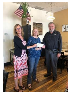
presenting annual check to

WEEKLY MEETINGS: 1 st , 2 nd & 3 rd Tuesday noon at Epic Egg 3830 W 10 th St Greeley